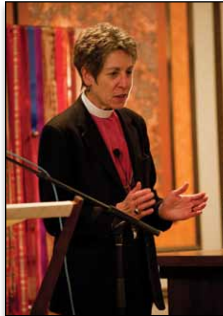
The Presiding Bishop speaking at the 2011 Winter Convocation.

youth) turned out to see her in Perrysburg where she held a town hall meeting on Friday evening, fielding a variety of questions from what she thought of the Egyptian move toward democracy to what she would like to say to the Archbishop of Canterbury (What can you find to love about the Episcopal Church?) to where she