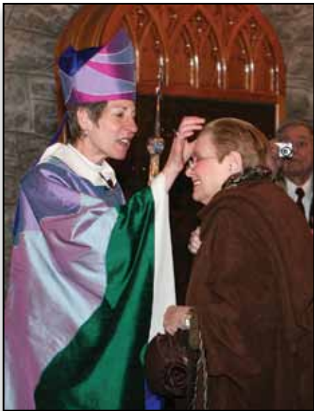
The Presiding Bishop blesses a parishioner during the service at St. John's Church, Youngstown.

the Covenant stronger has delayed any ability to move forward on it. "We've already won," she said. "We are learning that the church is not about regulation but about becoming better partners in mission." The parts of the church that are growing are those that are taking risks and are willing to tell their stories. She also said