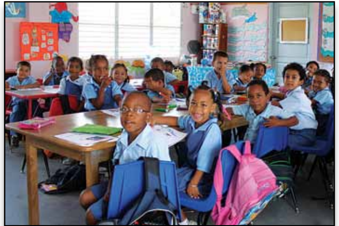
Students at one of the Anglican schools in Belize.