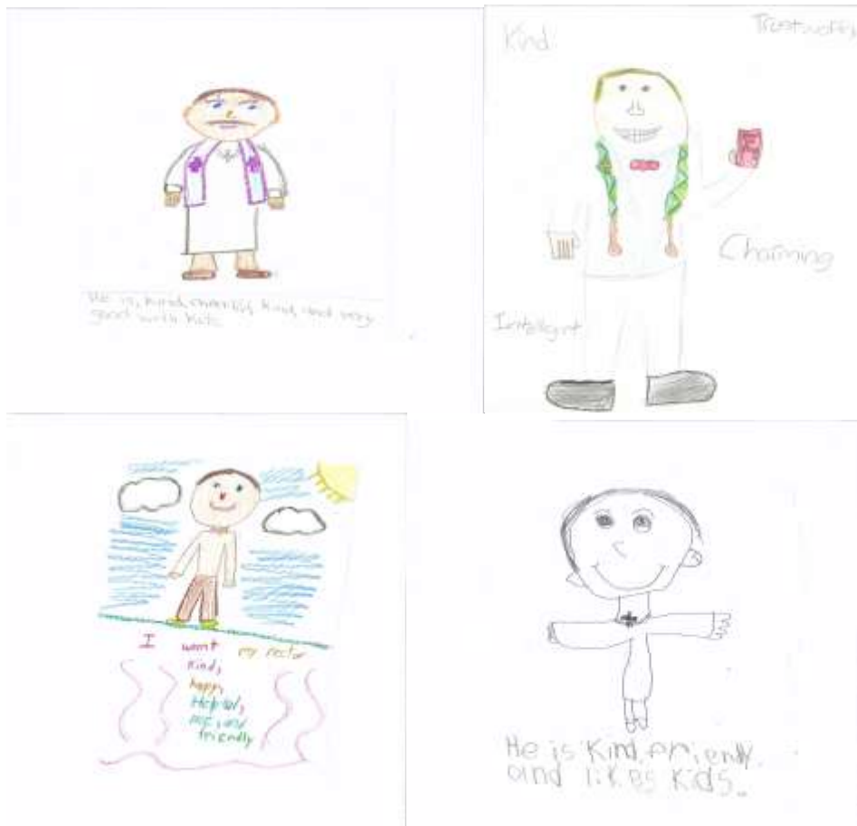
Our next rector as drawn by our Sunday school children

All of these desires add up to a large calling, but we do not expect perfection. The people of Grace Church are committed to sustaining their leader with understanding, volunteer support, feedback, and the love of Christ. Our role and responsibility as a community will be to provide an environment where our next rector's gifts can grow, expand, flourish, and ultimately complement our own.