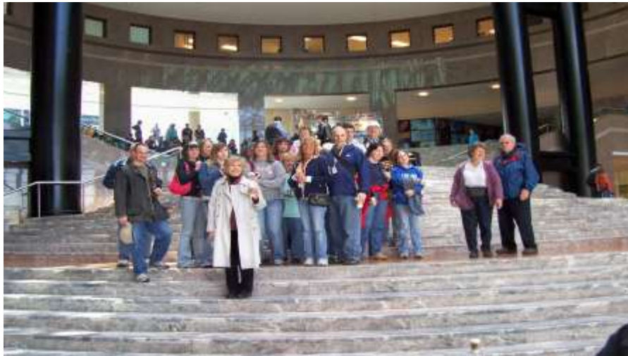
Grace Church Youth Group, New York City Trip

Our perennial challenge is to spark interest from our teenagers and young adults with meaningful education and Christian formation. We currently do not have an active youth or young adult group. It is imperative that our next rector engage and relate well to our younger members.