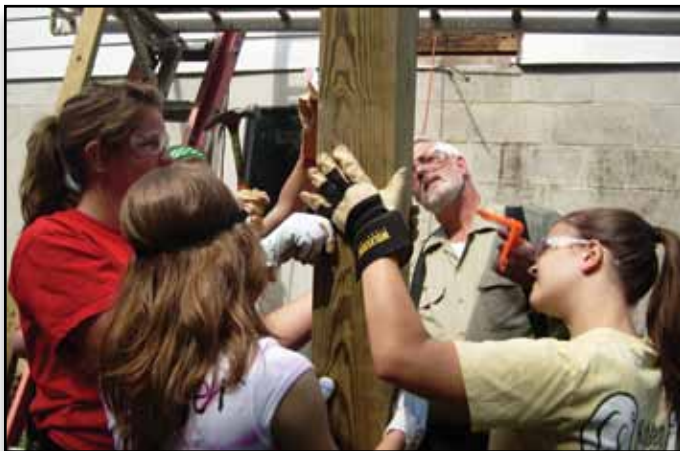
St. Michael’s-in-the-Hills, Toledo, youth mission trip to Barnes Mountain, Kentucky.