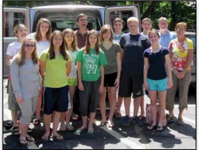
Volunteers from St. Michael's-in-the-Hills, Toledo, in Kentucky.

One morning the group conducted a Vacation Bible School for children of the community at St. Timothy's Outreach Center. St. Timothy's, where the group stayed,