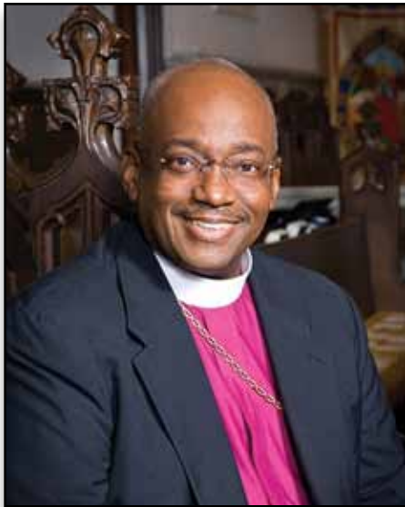
The Rt. Rev. Michael Bruce Curry, Bishop of North Carolina, will be the Keynote Speaker at next year's Annual Meeting.

At the recent meeting of the Diocesan ECW Board in Berea on September 10, 2011, we discussed the Annual Meeting, scheduled for May 4 and 5, 2012, at the Ramada Hotel in Toledo. We are extremely fortunate to have Bishop Michael Bruce Curry of the Diocese of North Carolina as our Honored Guest and Keynote Speaker on Friday night and Saturday morning. He is no stranger to Ohio, having served as the rector of St. Simon of Cyrene in Lincoln Heights near Cincinnati; those of our diocesan family who have attended a youth conference in Minnesota or the last Triennial can testify to his excellence as a speaker. Please mark the date on your calendar and look for updates on the meeting in News-Notes and mailings to your parish.