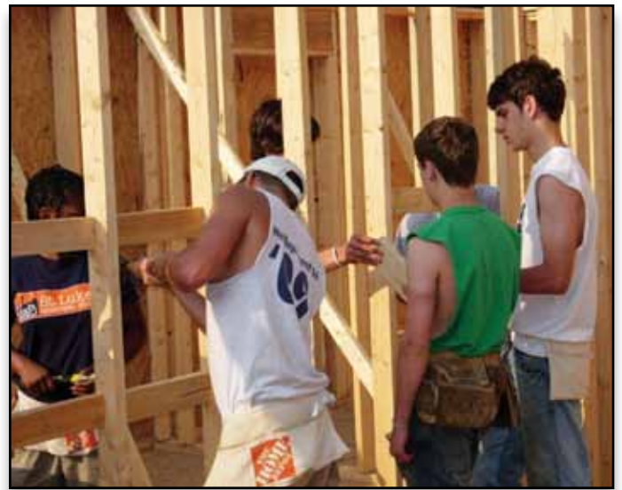
St. Paul's high school group framing a wall for cabinets in new housing (2006).

The most extraordinary memories come when we get to share these instances with Kentucky residents. The people of Harlan are by habit somewhat wary of outsiders, but over the years our church has been lucky enough to forge a number of lasting friendships. Their lives are less frantic and bustling than what we're used to, but no less blessed.